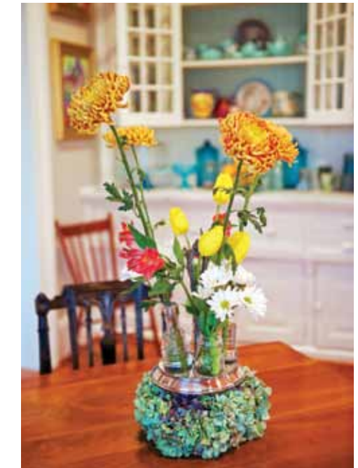
Fresh, cool teals and blues that tie in with the elaborate floorcloth under the table accent the rich, warm tones of the kitchen's ceiling and floor. Anchoring the island is an antique wooden toolbox layered with beloved hand-painted Italian pottery. On the table, an old oil and vinegar server has new life as a beautiful bud vase boasting a wreath of hydrangeas. Continuing the theme, turquoise glass bottles overflow from the butler's pantry—an exceptional and functional display case.

soon converted the former maid's apartment into a large working studio. She also spent a great deal of time revamping the kitchen, a space that had been only minimally enhanced since the home was built in 1913. Gorgeous heart-pine flooring, Carrera marble, and a ceiling painted the color of terra-cotta were striking updates to the heart of the home, while other treasures of the time, including an original butler's pantry and a water fountain, were lovingly maintained.